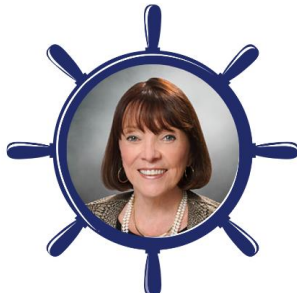
Commissioner Nancy Gregoire Stamper